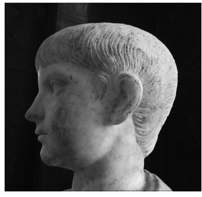
Figure 3. Portrait of the teenage Nero from his earliest 'Adoption' type preserved in the Musée du Louvre, Paris: a) front; b) left profile (Miles Russell)

Apart from the images of the young prince that would have been circulated on official coinage, at least three sculptured versions of the 'Adoption' and 'Heir Apparent' Nero have been recorded from Britain. At Fishbourne, in West Sussex, a large fragment of Nero from his earliest portrait type, probably from the so-called 'proto Palace' (dating to the mid AD 60s) was found reused in the foundation rubble of the later 'palace proper' (Cunliffe and Fulford 1982, 24; Russell and Manley 2013a, 3.3), whilst a mutilated replica of Nero made at or shortly after his accession in AD 54