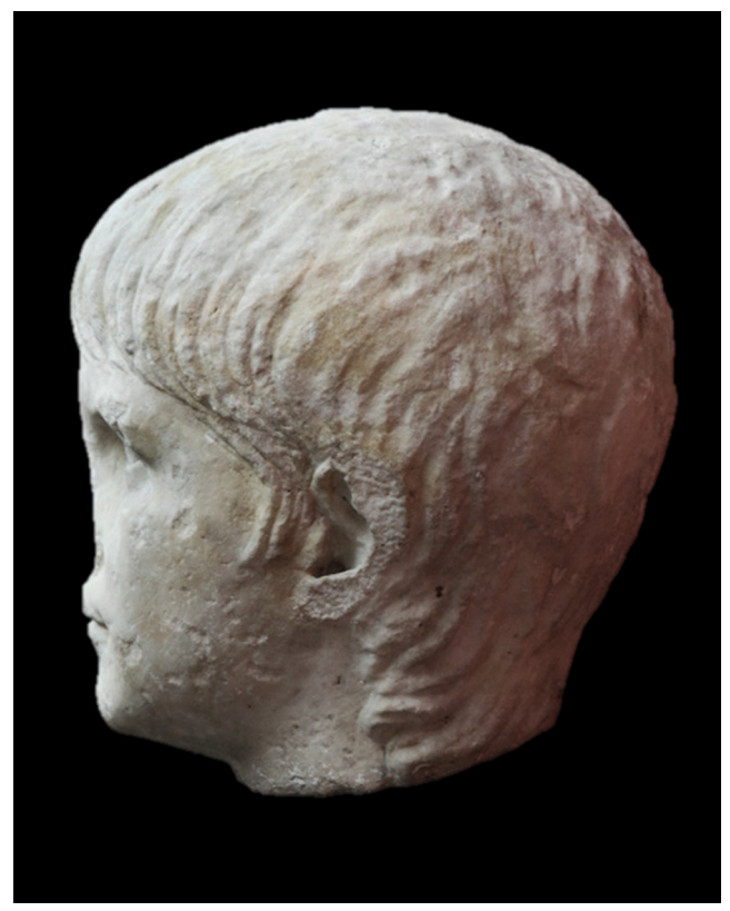
Figure 4. Portrait of the teenage Nero from his earliest 'Adoption' type preserved in the Römisch-Germanisches Museum, Cologne: a) front; b) left profile (Roger Ulrich)