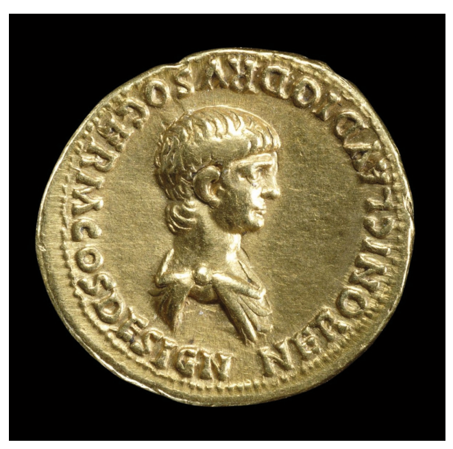
Figure 2. Coin portrait of Nero in his first coiffure type minted between AD 51 – 54

with increasingly fleshy features, can be observed in coin portraits commemorating his fifth and tenth anniversaries in power (AD 59 and 64: Hiesinger 1975, 119-20).