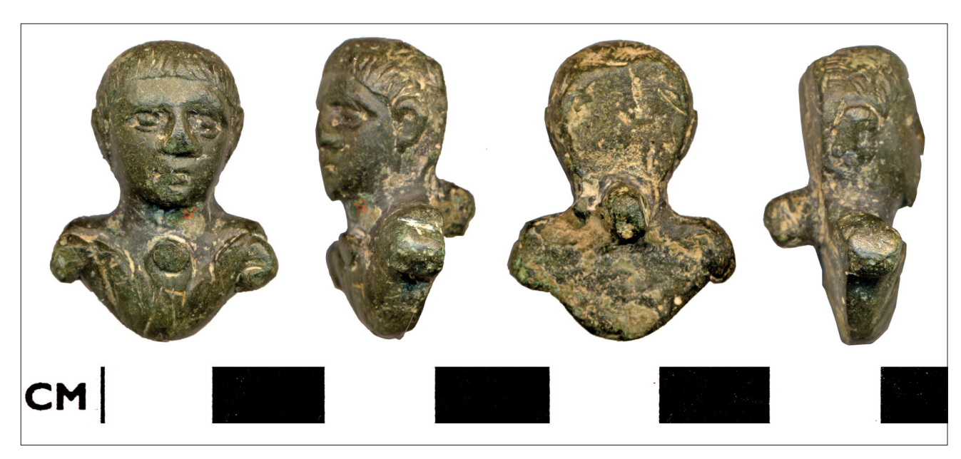
Figure 1. Photographs of the Tarrant Rushton copper alloy bust: front, left profile, back, right profile

At the base of the neck is a small flat projection, an oval disc, with a crescent beneath it, of uncertain purpose, but possibly representing a bulla (an amulet worn by Roman boys, but also worn by adult males at important ceremonies) and perhaps another medallion, but, if so, the means of suspension for neither is indicated. The lower part of the chest is draped before a curving truncation. The drapery has a wavy upper edge and is formed into a curl over each of the truncated shoulders. The back is flat with a slightly uneven surface, resulting from the casting. There is a rectangular sectioned integral rivet projecting from behind the neck. The style of the bust is similar to representations of emperors on coins and in other portraiture of the first century AD. The flat back and attachment spike may indicate that the mount was originally fixed to a casket or other furniture. The object has been recorded under the Portable Antiquities Scheme as DOR-6E73F1. A very similar copper alloy Roman mount has been recorded from Hadham in Hertfordshire (BH-84F731).